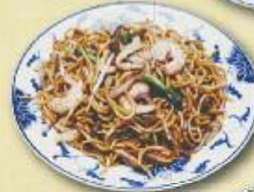
House Special Lo Mein