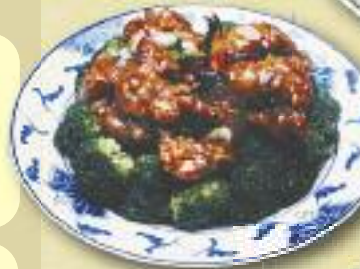
General Tso's Chicken