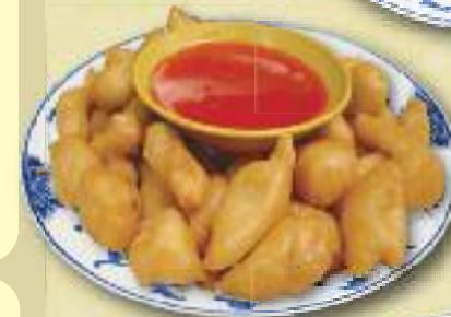
Sweet & Sour Chicken