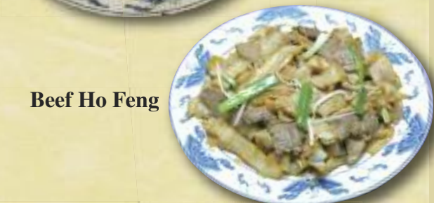
Beef Ho Feng