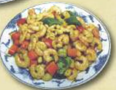
Kung Pao Shrimp