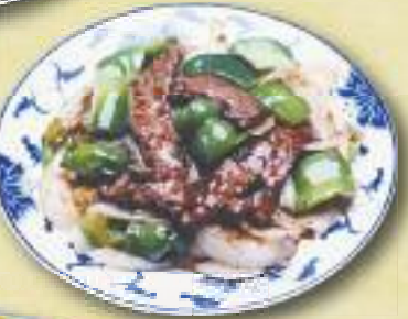
Pepper Steak w. Onion