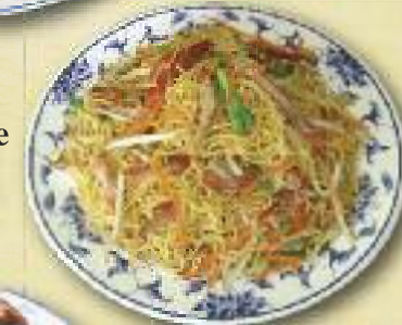
Pork Cantonese Egg Noodle